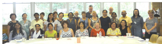
Catechists in the parish.