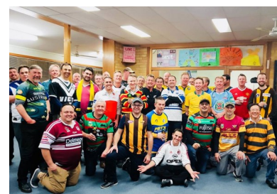
Dads' Club St Gerard's Parish Meeting Room