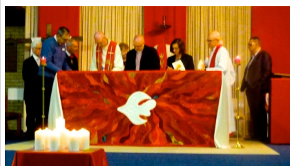
Signing of the Ecumenical Covenant at Pentecost.