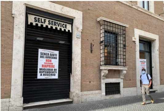
A man walks past a coffee bar and cafeteria on the Via della Conciliazione near the Vatican on 9 June, 2020. The sign in the window says, "Without government help, we cannot reopen. Thousands of employees at risk".

With so many people left unemployed or in a precarious position because of the COVID-19 pandemic, Pope Francis launched a fund aimed specifically at helping people in Rome struggling economically in the wake of the crisis.